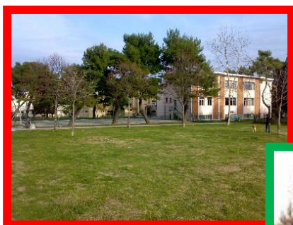
PUCCINI PRIMARY SCHOOL